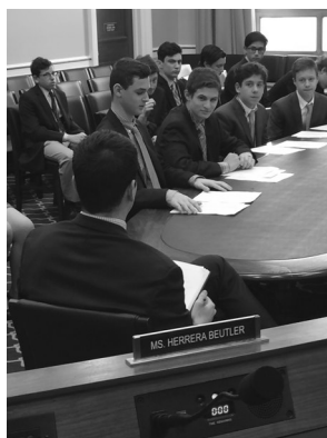
Urging Congresswomen Nita Lowey's staff to add co-sponsors and bring to the house floor Equal Access to Abortion Coverage in Health Insurance (EACH Woman) (H.R.2972).