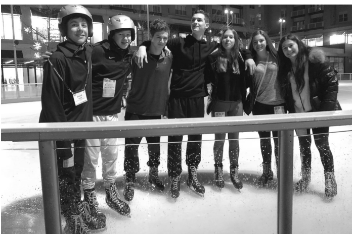
Ice skating after dinner at Pentagon Row.