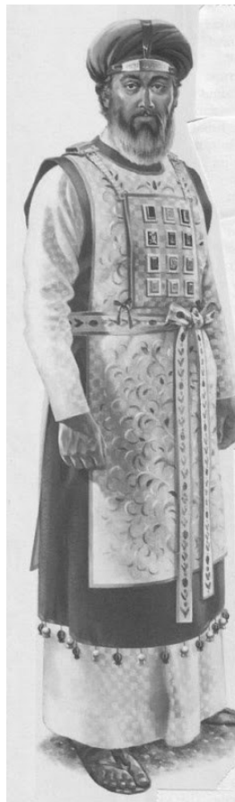
An artists rendering of what Aaron's garments may have looked like based on the Biblical text

the world, we offer bits of the essence of ourselves. The garments, and Aaron himself, are only vessels for the ruach chochma .