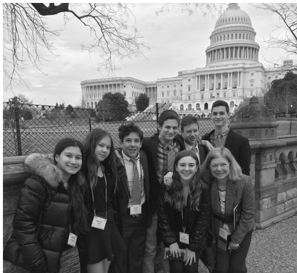
On our way to Senator Schumer's office.